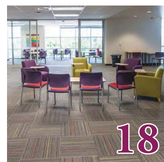
NEW LIBRARY LEARNING CENTER