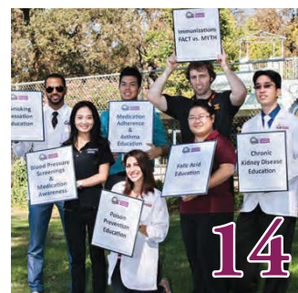
CAMPUS-WIDE HEALTH FAIR